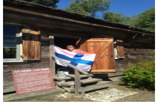
Peggy at the Lindgren Cabin